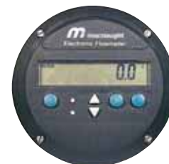
Deluxe LC Display