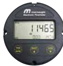
Standard LC Display