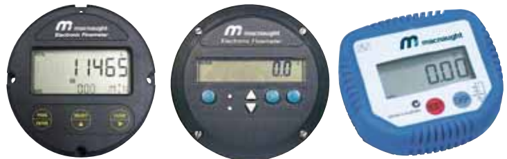
Standard LC Display